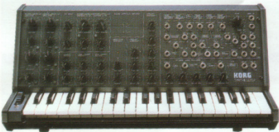
MS-20 MONOPHONIC SYNTHESIZER Studio Quality Effects with Two of Each Basic Module Plus S & H and ESP.