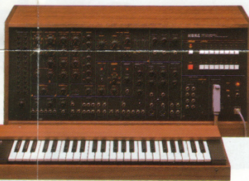
PS-3200 PROGRAMMABLE POLYPHONIC SYNTHESIZER For professionals, the only fully polyphonic synthesizer with patching system and tone color memory in the world.