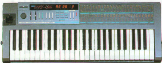
KORG POLY-800 PROGRAMMABLE POLYPHONIC SYNTHESIZER World's First Affordable 8-Voice Polyphonic Synthesizer with 64-Program Memory, Editing, and Sequencer.