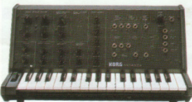
MS-10 MONOPHONIC SYNTHESIZER Monophonic Synthesizer with Patch Panel for total Creativity.