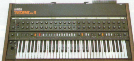
KORG TRIDENT MKII PERFORMING KEYBOARD 2 VCO, 8-voice polyphonic keyboard with 32-program memory, tape interface, editing function, and a full synthe section.