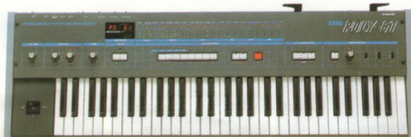
KORG POLY-61 PROGRAMMABLE POLYPHONIC SYNTHESIZER The Korg Poly-61 the 6-voice programmable synthesizer offering 64 programs and 2 oscillators per voice at an incredibly low price.