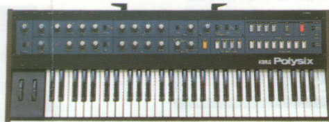
KORG POLYSIX PROGRAMMABLE POLYPHONIC SYNTHESIZER 6-voice programmable poly with 32 programs, tape interface, programmable chorus/ensemble, unison mode and arpeggiator.