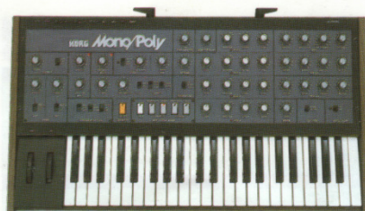
KORG MONO/POLY 4 VCO SYNTHESIZER 4-VCO lead synthe with mono- and polyphonic modes, arpeggiator, presettable sync and cross-mod effects and chord memory.