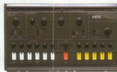
X-911 GUITAR SYNTHESIZER Adjust Pitch and Tone Color to Create the Sounds You Want. The Guitar Synthesizer that's as Easy to Use as an Effects Device.