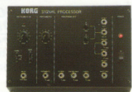
MS-03 SIGNAL PROCESSOR