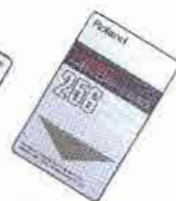
M-256D MEMORY CARD