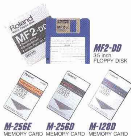
M-256E MEMORY CARD M-256D MEMORY CARD M-128D MEMORY CARD

PN-D10-01 consists of a collection of synthesizer and instrument sounds, while PN-D10-02 includes an assortment of 48 new rhythm sounds and 16 "user-friendly" bass sounds which, like all D-Series sounds, can be used as they are or modified to suit your particular tastes.