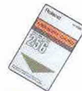
M-256E MEMORY CARD